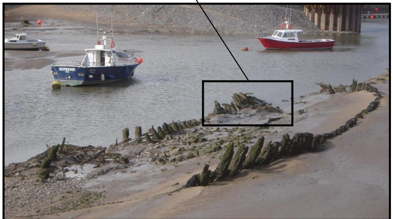
City of Ottawa - Rhyl Harbour, North Wales